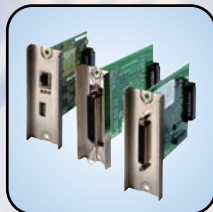
Plug-In Interface Modules