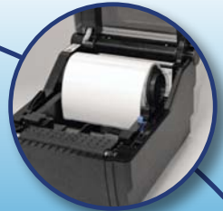
Drop - Load - Go Media Bin