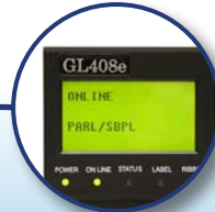
Large LCD Display Panel