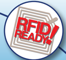
RFID Designed Printer