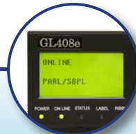
Large LCD Display Panel