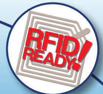
RFID Designed Printer