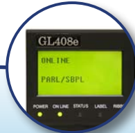
Large LCD Display Panel