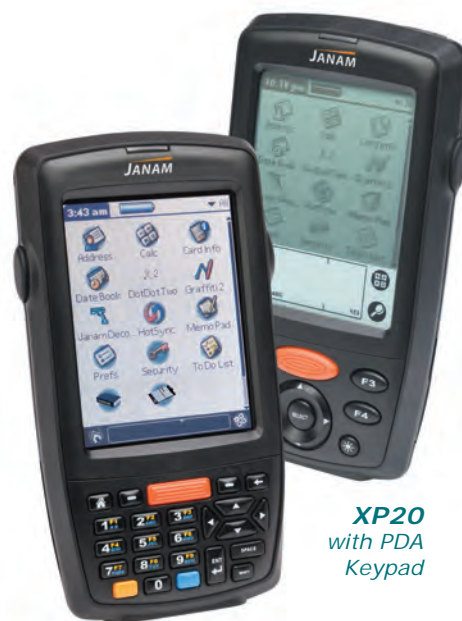
XP30 with Numeric Keypad

The XP30 is the world's first fully-featured mobile computer that scans barcodes and runs the latest version of the Palm OS. A brilliant, color, quarter-VGA display and blazing Freescale™ architecture make the XP30 a best-of-breed, rugged, barcode scanning, mobile computer, while its list price makes it impossible to ignore. For customers who want to extend the reach and capability of their mobile Palm applications, the XP30 has the horsepower to execute mission-critical data collection tasks at the point of business activity. And for customers who are ready to switch to the Palm OS for its simplicity and its durability, the XP30 is a platform that pays for itself twice as fast as comparable devices.