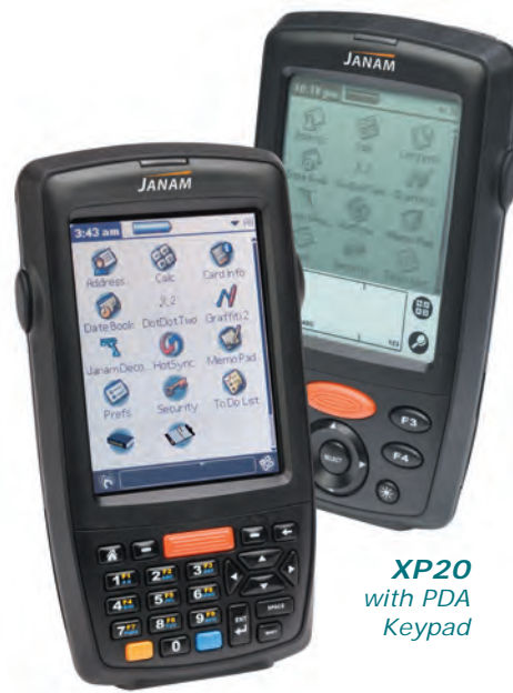
XP30 with Numeric Keypad

The XP30 is the world's first fully-featured mobile computer that scans barcodes and runs the latest version of the Palm OS. A brilliant, color, quarter-VGA display and blazing Freescale™ architecture make the XP30 a best-of-breed, rugged, barcode scanning, mobile computer, while its list price makes it impossible to ignore. For customers who want to extend the reach and capability of their mobile Palm applications, the XP30 has the horsepower to execute mission-critical data collection tasks at the point of business activity. And for customers who are ready to switch to the Palm OS for its simplicity and its durability, the XP30 is a platform that pays for itself twice as fast as comparable devices.