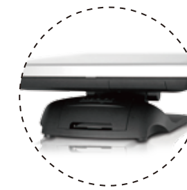
Flat Folded Mode