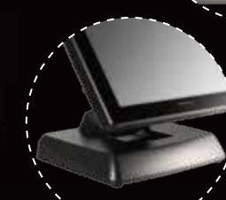
With 2nd display LCD

Optional 8th Generation Base that integrates internal power adaptor and Powered USB port into the base stand, which allows for clutter free counter.