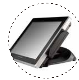
Low Profile Mode